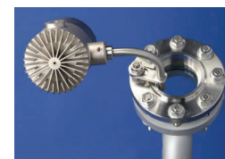
For fiber optic flexible bundle models reference datasheet P/N TA10836-1.

HOW TO ORDER: Select the appropriate symbols and build a part number as shown.